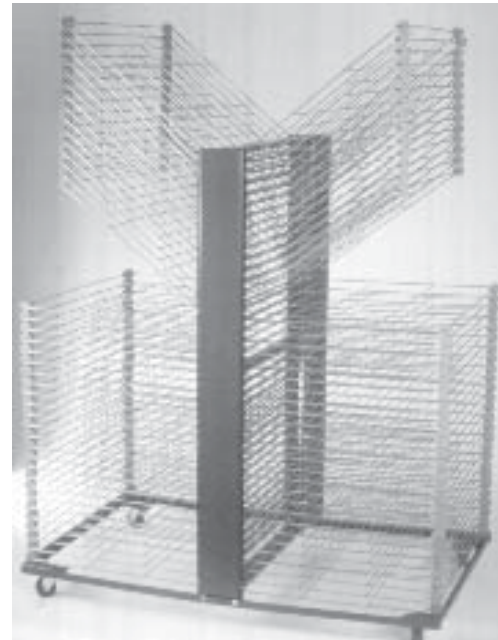
Double Tensor - 18